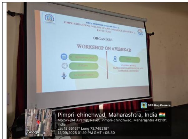
AVISHKAR SESSION 2025