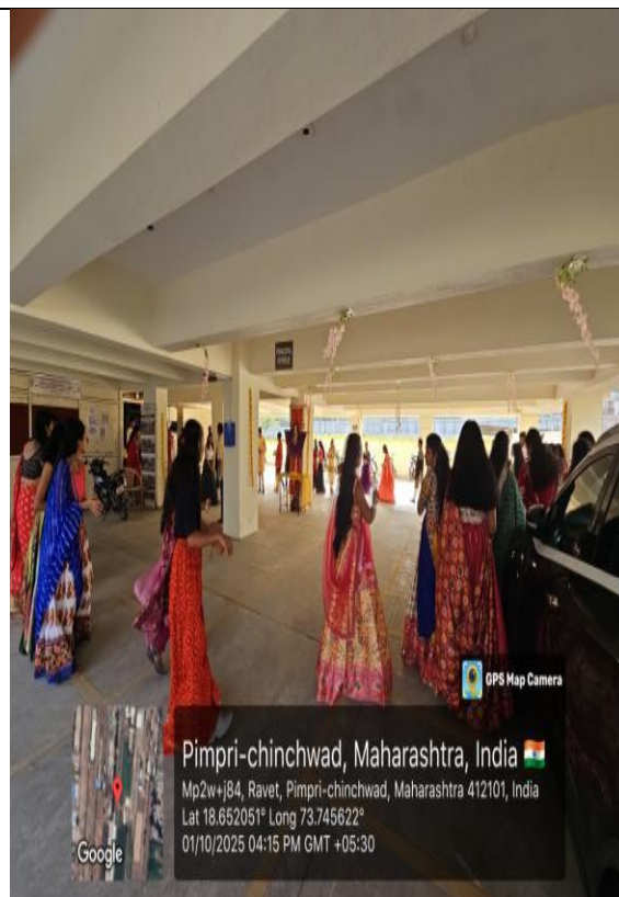
Garba played by students