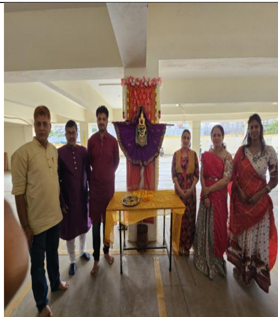
Faculties with Ghat