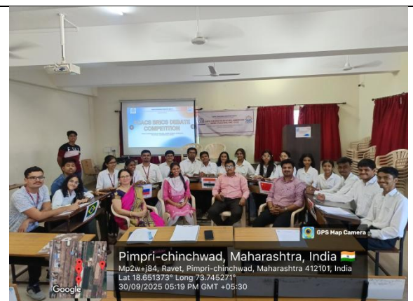
All groups with faculties