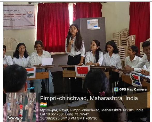
Introduction to debate