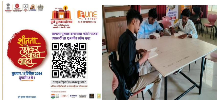
Pune book festival at PCACS