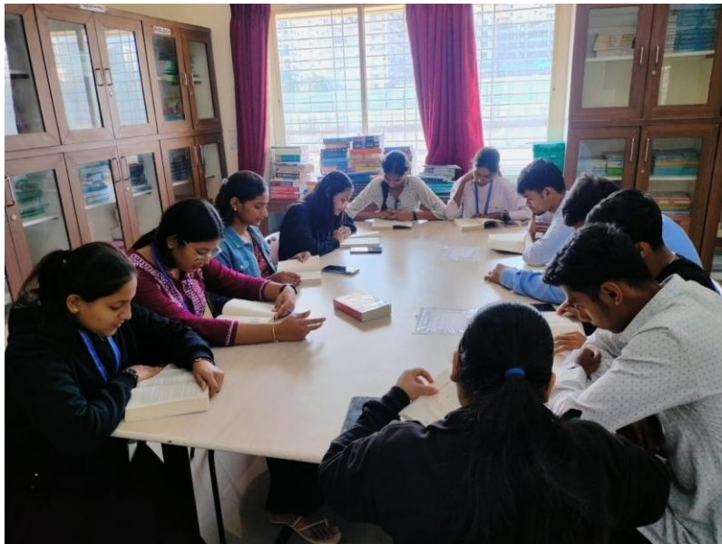
Books: The Best Companion for Every Student."